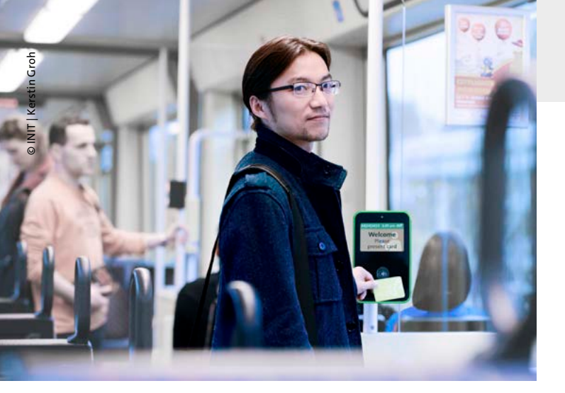
Fast check-in and check-out at the PROXmobile3 passenger terminal.