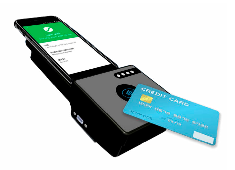
| Fare media can be inspected with the mobile e-ticketing reader PROXreader2.